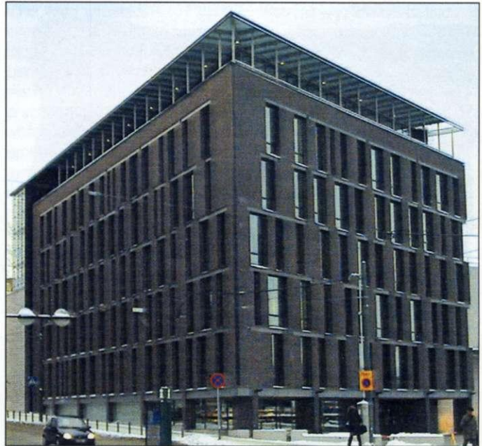
Beware of corners of buildings

Sitting or sleeping in the line of attack will disturb a person. Short term effect is usually irritation, quarrelsomeness, and in most sensitive people, headaches or other bodily aches. If a family member has the habit of going into angry fits when sitting at the dining table, you may want to check whether there is a corner directed towards the seat. A mirror or even a glass covering a picture on the wall