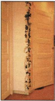
Covering a corner

A corner pointing at a door will disturb the nature of qi entering through the opening. When there is a corner inside a house, directed at a door of any importance (bedroom, living room), it is advisable to do something about it. In some old buildings such corners are rounded, which is good Feng Shui. We can cover the corner with rounded covering strip, a statue, a piece of furniture, or a plant.