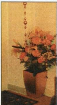
Plant in front of corner

For those, who want to use pretty lead crystals for Feng Shui purposes, this is the appropriate place to hang them in rather than in windows. However, real faceted quartz crystals, especially of the amethyst kind, should be neatly stored in boxes or cupboards, because their sharp points emit powerful energy, which has the potential to act with local qi in damaging ways. Amethyst crystals and fire qi together can be harmful to eyes and heart.